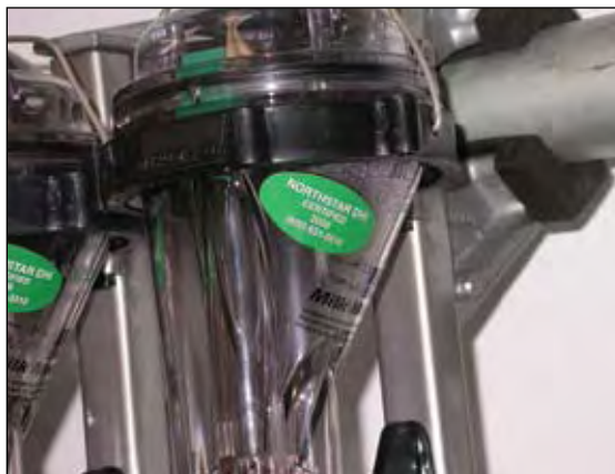
Figure 1. Certified milk meter

at least annually. Figure 1 illustrates a certified milk meter. This is an approved type of meter; and, it bears a calibration sticker. (Calibration tags or bands are also acceptable.) When a field technician brings milk meters to a dairy on test day, make sure all meters used bear a current calibration sticker or tag. If some meters don't have a calibration sticker, ask the technician to use only calibrated meters. The calibration sticker indicates routine maintenance and proper function, and when and where the meters were calibrated. Using certified meters is key to getting an accurate recording of milk production and a representative milk sample.