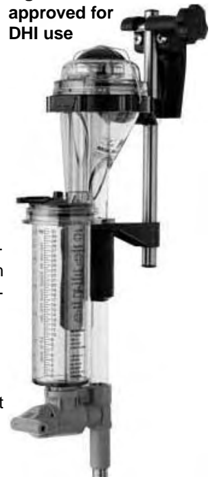
Figure 2. Milk meter not approved for DHI use